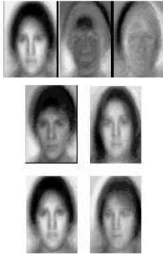
FIGURE 1. The first three eigen-images of a face matrix comprised of equal numbers of male and female faces (row 1). The first eigenvector plus the second eigenvector appears on the left of row 2 making a face with a male appearance. The first eigenvector minus the second eigenvector appears on the right of row 2 making a face with a female appearance (row 2). The first eigenvector plus the third eigenvector appears on the left of row 3. The first eigenvector minus the third eigenvector appears on the right of row 3. The face on the right appears more feminine than the face on the left.

face set. Second, different “amounts” of each eigenvector are required to reconstruct particular faces. These amounts measure the importance of the individual eigenvectors for representing individual faces and are important for understanding how a particular face differs from other faces in the set. We will refer to these amounts for a particular face as the face’s “weights” with respect to the eigenvectors. We have concentrated on eigenvectors explaining large proportions of variance in the face set, since a number of studies have indicated that these eigenvectors contain reliable information for predicting the gender of a face (Abdi et al., 1995; O’Toole et al., 1993; O’Toole et al., in press). This is not surprising, given that gender is one of the basic “features” on which faces can be contrasted, and hence, is likely to explain a large proportion of variance in a set of faces.